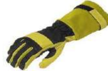
FIRE FIGHTING GLOVES