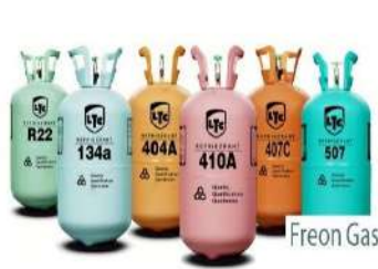
DIFFERENT TYPES OF REFRIGERANT GAS