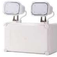
TWIN HEAD LIGHT IP65