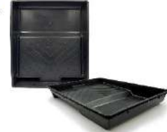
PAINT TRAY PLASTIC