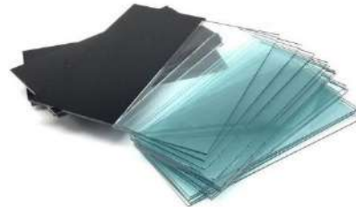
WELDING GLASS LENS