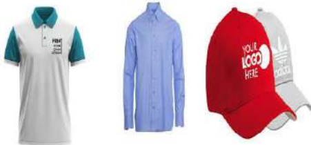
CUSTOMIZED T SHIRT & SHIRT & CAP WITH COMPANY LOGO