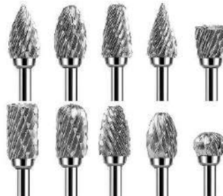
CARBIDE BURR SET