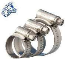
HOSE CLIP JUBILEE