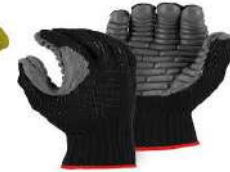
ANTI VIBRATION GLOVES