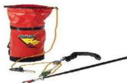
GOTCHA RESCUE KIT