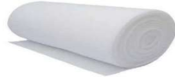
DAKRON AIR FILTER ROLL