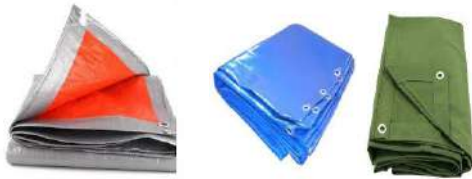
TARPAULIN & CANVAS FIRE RATED&WATER PROOF