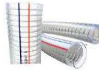
REINFORCED HOSE STEEL WIRED