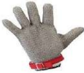
CUT RESISTANT STAINLESS-STEEL GLOVES