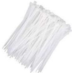
CABLE TIE NYLON WHITE