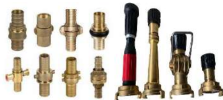
FIRE HOSE NOZZLE