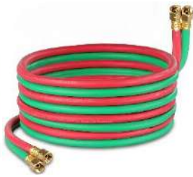
OXYGEN & ACETYLENE TWIN HOSE