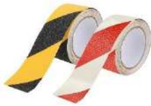
ANTI SLIP TAPE