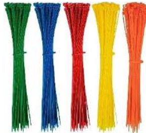
CABLE TIE NYLON COLORED