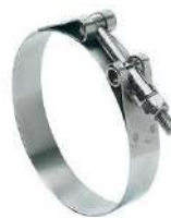
T BOLT HOSE CLAMP