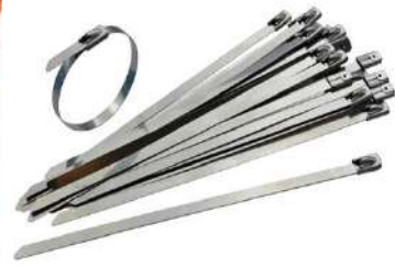
STAINLESS STEEL CABLE TIE