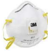
3M DISPOSABLE FACE MASK