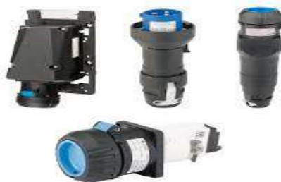
EXPLOSION PROOF SOCKET & PLUGS