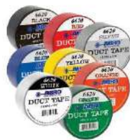
COLOR DUCT TAPE