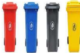
GARBAGE BIN PLASTIC