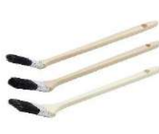
PAINT BRUSH ANGLE