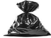
GARBAGE BAG HEAVY DUTY