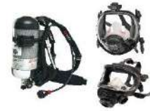
3M SCOTT SCBA