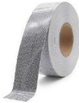
SOLAS REFLECTIVE TAPE