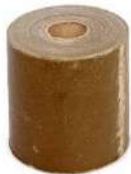
DENSO TAPE GREASE TAPE