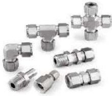
COMPRESSED TUBE FITTINGS