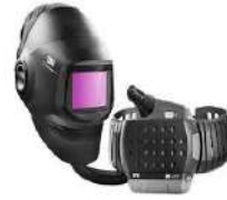
3M WELDING RESPIRATORY HELMET