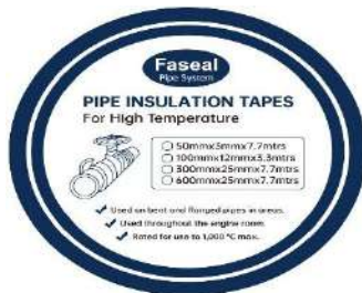
PIPE REPAIR TAPE