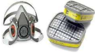
3M HALF FACE MASK & CARTRIDGE