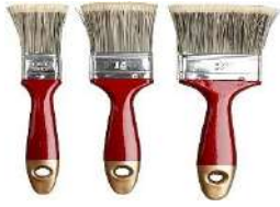
PAINT BRUSH FLAT