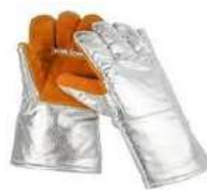
HEAT RESISTANT GLOVES