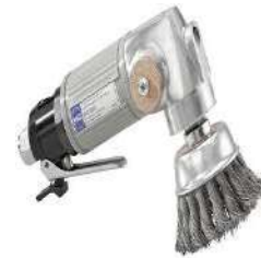
PNEUMATIC DERUSTING BRUSH AIR