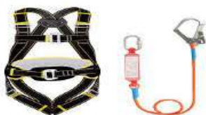
FULL BODY HARNESS WITH LANYARD