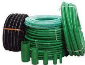
SUCTION & DELIVERY HOSES