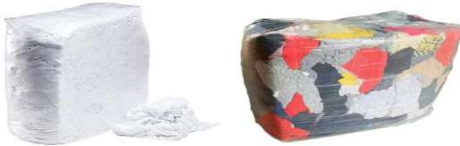
COTTON RAGS: COTTON 100% WHITE, STERILIZED COTTON & MIXED COLOR