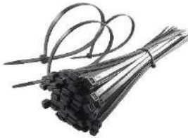
CABLE TIE NYLON BLACK