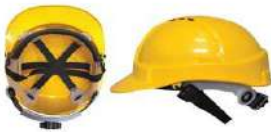
SAFETY HELMET VENTED WITH RATCHET