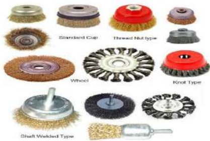
WIRE CUP BRUSHES – STEEL – BRASS – STAINLESS STEEL