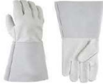
TIG WELDING GLOVES