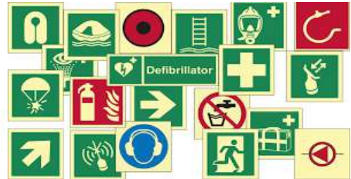
IMO STICKERS AND POSTERS