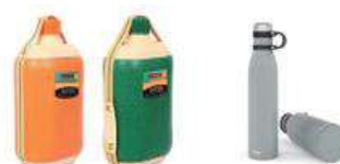
DRINKING WATER BOTTLES